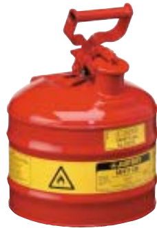
2 Gal. Type I Model # JR-10501 SPECIAL $ 47.95