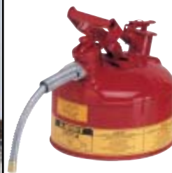
1 Gal. Type II Model # JR-10327 SPECIAL $ 97.95