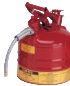
2 Gal. Type II Model # JR-10527 SPECIAL $ 99.95