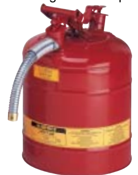
5 Gal. Type II Model # JR-10828 SPECIAL $ 102.95

These products meet compliance and regulatory requirements