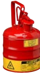
1 Gal. Type I Model # JR-10301 SPECIAL $ 44.95