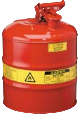
5 Gal. Type I Model # JR-10801 SPECIAL $ 52.95

Type I Safety cans are designed with a single spout for filling and pouring. The self closing, leakproof lid controls vapours and provides security from spills and leaks. Unique counterbalanced design handle offers gravity assisted pouring. Larger capacity (over 1 gal) feature a swinging rounded handle that greatly eases carrying heavier loads. Heavy duty high grade coated, lead free steel construction with reinforcing ribs to strengthen side walls for extra "bumper guard" protection.