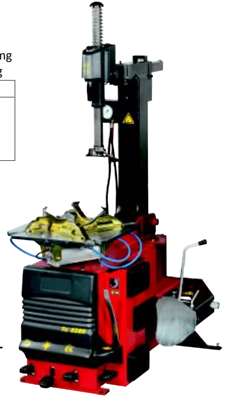
Model # TC-0528IT

Get your SPECIAL COSTING Click for Quote Form