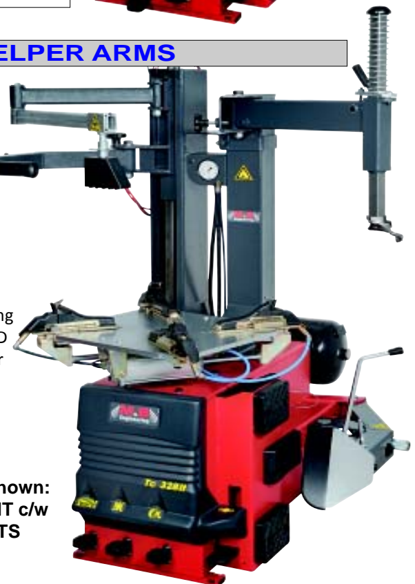
Model Shown: TC-0328IT c/w TC-0300TS

OPTIONAL: Technoswing Helper: Roller Arm AND follow Arm package for the tough jobs.