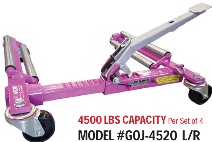
4500 LBS CAPACITY Per Set of 4 MODEL #GOJ-4520 L/R Suggested $429.45 ea