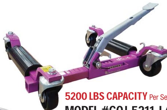
5200 LBS CAPACITY Per Set of 4 MODEL #GOJ-5211 L/R Suggested $429.45 ea