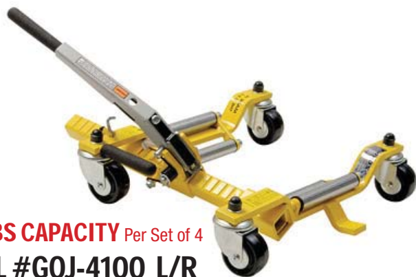
4100 LBS CAPACITY Per Set of 4 MODEL #GOJ-4100 L/R Suggested $659.39 ea