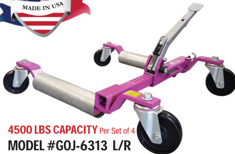
4500 LBS CAPACITY Per Set of 4 MODEL #GOJ-6313 L/R Suggested $439.95 ea