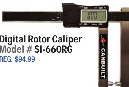
Digital Rotor Caliper Model # SI-660RG REG. $94.99