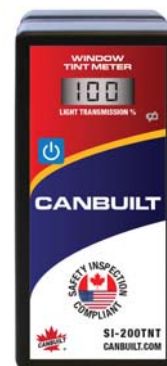
Window Tint Meter Model # SI-200TNT REG. $299.00