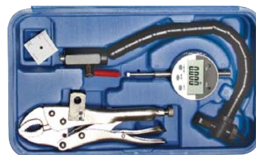
Digital Ball Joint Gauge Model # SI-105BJ REG. $129.00