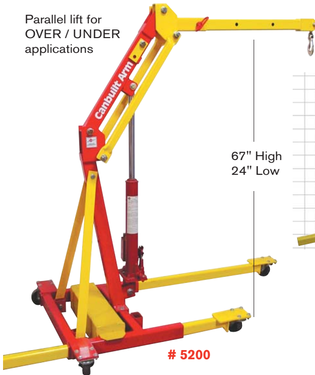
Parallel lift for OVER / UNDER applications