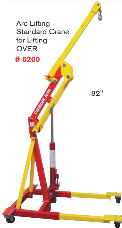
Arc Lifting Standard Crane for Lifting OVER # 5200