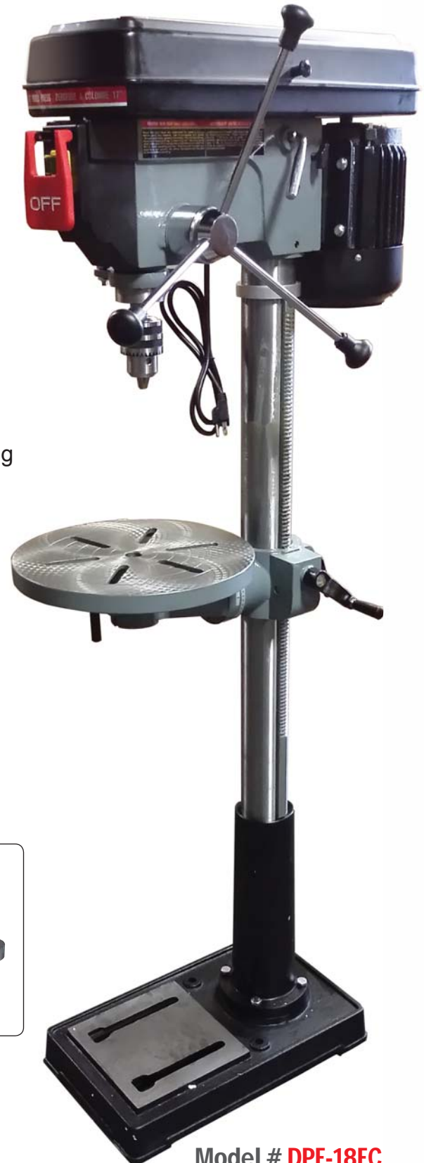
Model # DPF-18FC