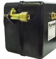
Model # C-SV190

Pressure switch Unloader Valve 115 psi cut in 150 psi cut out 1/4" female NPT