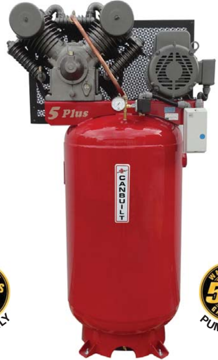
Model # C-HP580V