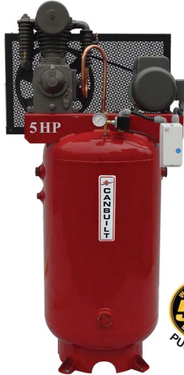
Model # C-IC580V