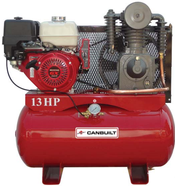
Model # C-1330HCICWC