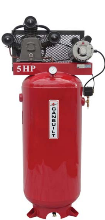
Model # C-560V