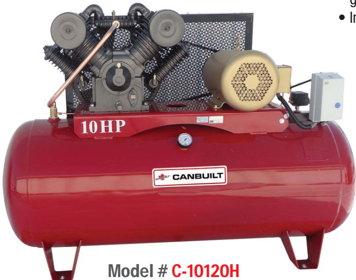
Model # C-10120H