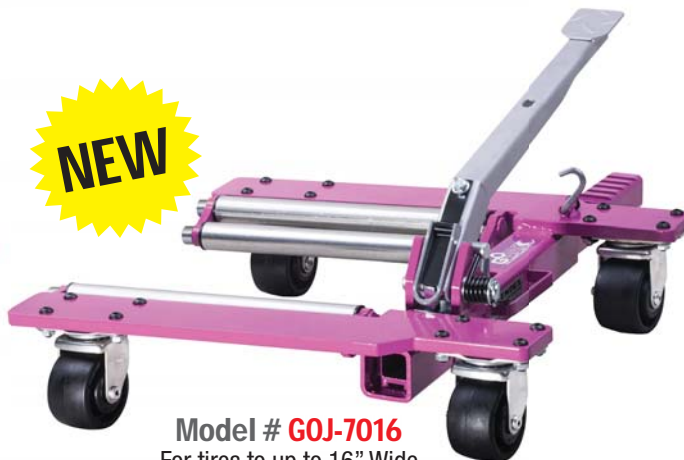
Model # GOJ-7016 For tires to up to 16" Wide 1,750 lbs per unit (Up to 7000 lbs capacity with 4 units) For SUV & Light Duty Trucks