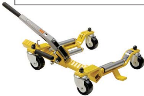
Model # GOJ-4100L/R For tires to 7" Wide 1,025 lbs capacity per unit (Up to 4,100 lbs capacity with 4 units)