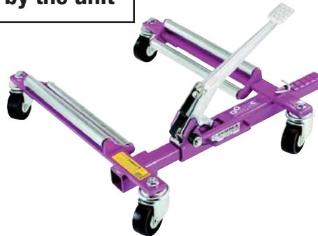
Model # GOJ-4520 For tires to 20" Wide 1,125 lbs capacity per unit (Up to 4,500 lbs capacity with 4 units)