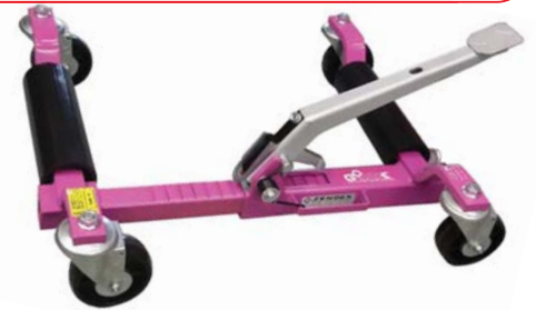
Model # GOJ-5211L/R For tires to 9" / 11" Wide 1,300 lbs capacity per unit (Up to 5,200 lbs capacity with 4 units)