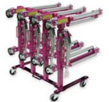
Also Available Model # GOJ-0400 Gojak Storage Rack