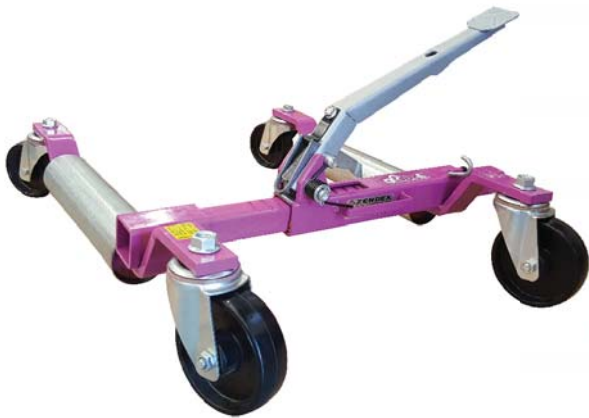
Model # GOJ-6313L/R For tires to 13" Wide 1,575 lbs capacity per unit (Up to 6,300 lbs capacity with 4 units)